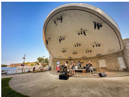
Live on the Lake Summer Concerts