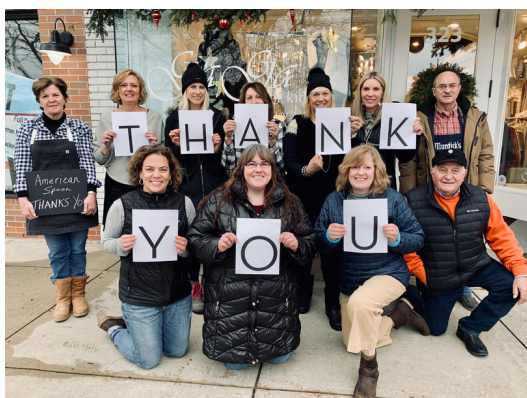
Gift Local Holiday Shopping Contest